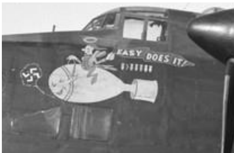
A wartime photo of Halifax JD372's first nose art