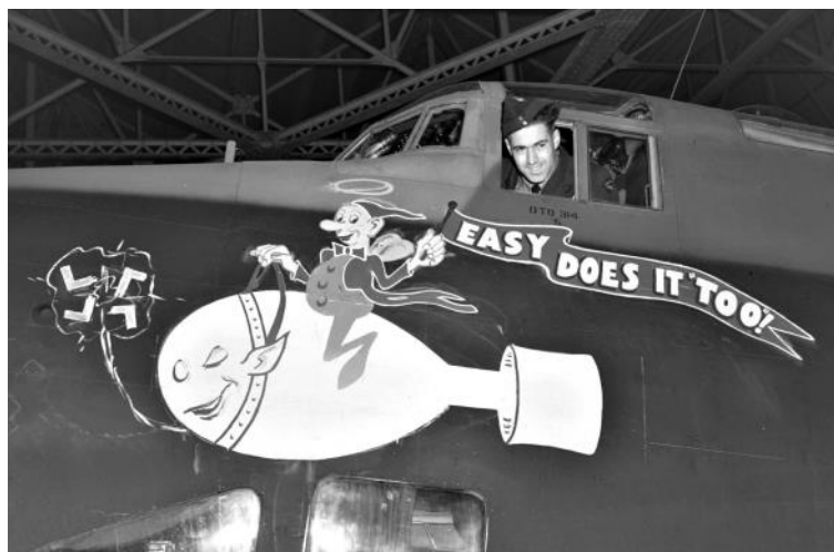
A wartime photo of Halifax JD372's second nose art

RCAF Halifax JD372 was flown by 429 Squadron RCAF, based at Leeming in Yorkshire. The aircraft's nose art, 'Easy Does It!', featured a 'Gremlin' riding a huge bomb which is going to destroy Nazis. The aircraft's markings were 'AL-E', the 'AL' indicating that it was a 429 Squadron bomber and the 'E' indicating that it was squadron aircraft 'E for Easy'.