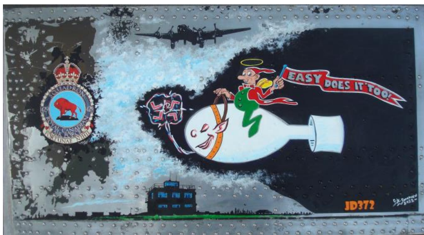
Nose art replica paintings by Clarence Simonsen