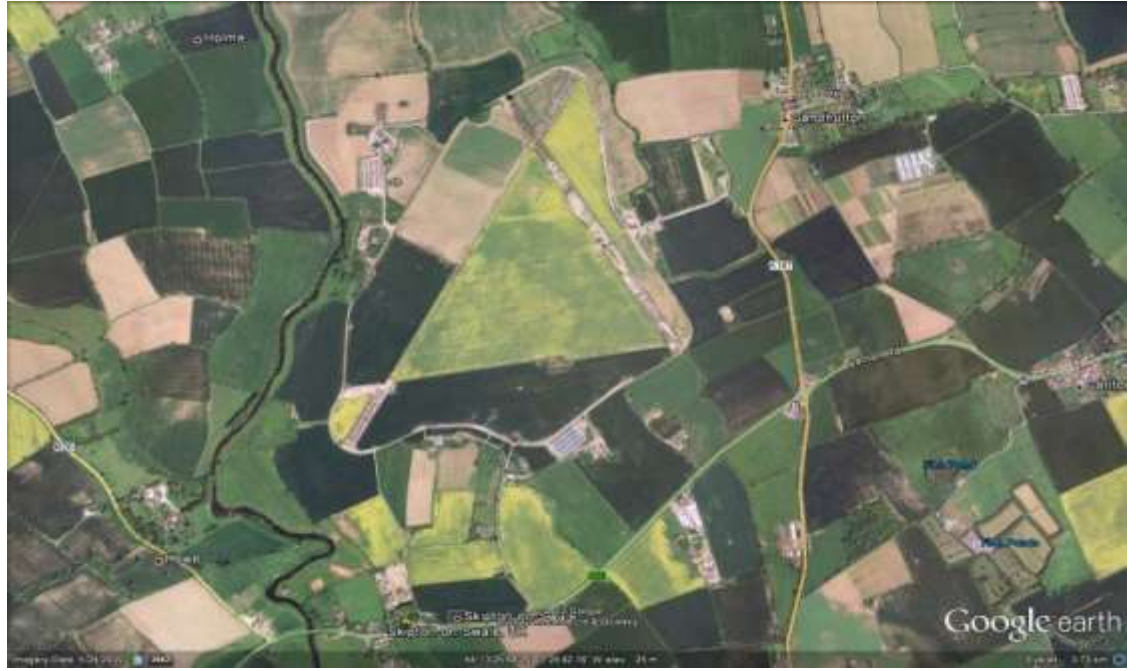
Skipton-on-Swale airfield – 2010 – (note: Swale River running north to south on left quadrant of the photo)

No. 420 'Snowy Owl' - No. 4 Group - August 7<sup>th</sup>, 1942 to October 15<sup>th</sup>, 1942No. 432 'Cougar'- No. 6 Group - May 1<sup>st</sup>, 1943 to September 18<sup>th</sup>, 1943No. 433 'Porcupine'- No. 6 Group - September 25<sup>th</sup>, 1943 to August 30<sup>th</sup>, 1945No. 424 'Tiger'- No. 6 Group - November 1943 to August 29<sup>th</sup>, 1945No. 424 'Tiger'- No. 1 Group - August 30<sup>th</sup> 1945 to October 15<sup>th</sup>, 1945