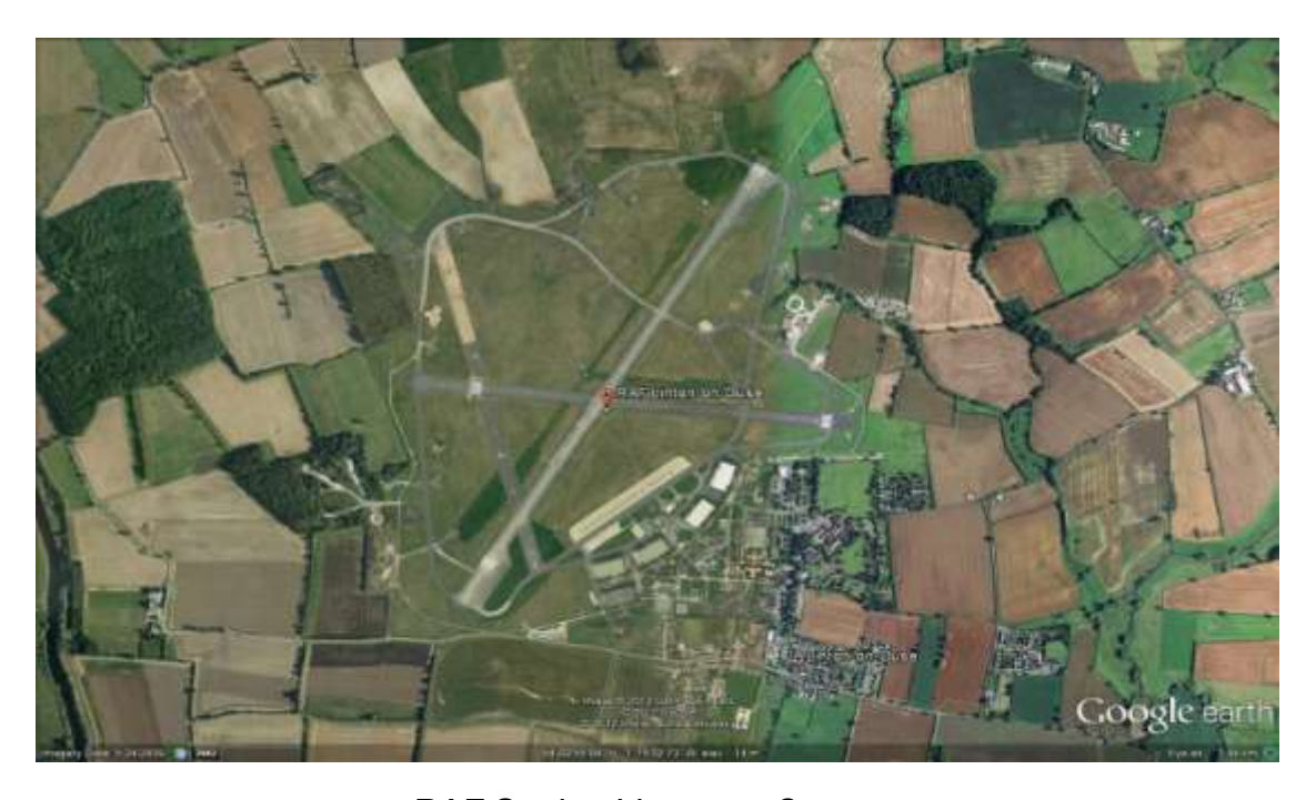
RAF Station Linton-on-Ouse

From November, 1945 RAF Transport Command operated No. 1665 HCU at Linton until May 1946. Fighter Command, with Mosquito, Hornet, Meteor, Sabre, and Hunter aircraft operated from Linton Air Station until 1957. The airfield then became the site of No. 1 Flying Training School, with Vampire, Jet Provost, and Tucano aircraft.