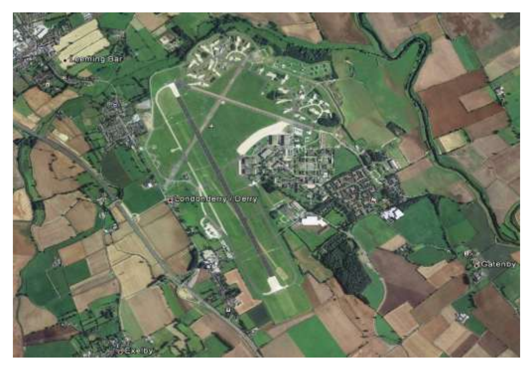
Leeming Air Station –