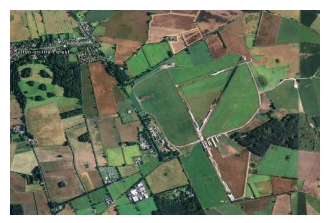
The former site of East Moor, Yorkshire Air Station

No. 415 'Swordfish' – No. 6 Group – July 26<sup>th</sup>, 1944 to May 15<sup>th</sup>, 1945