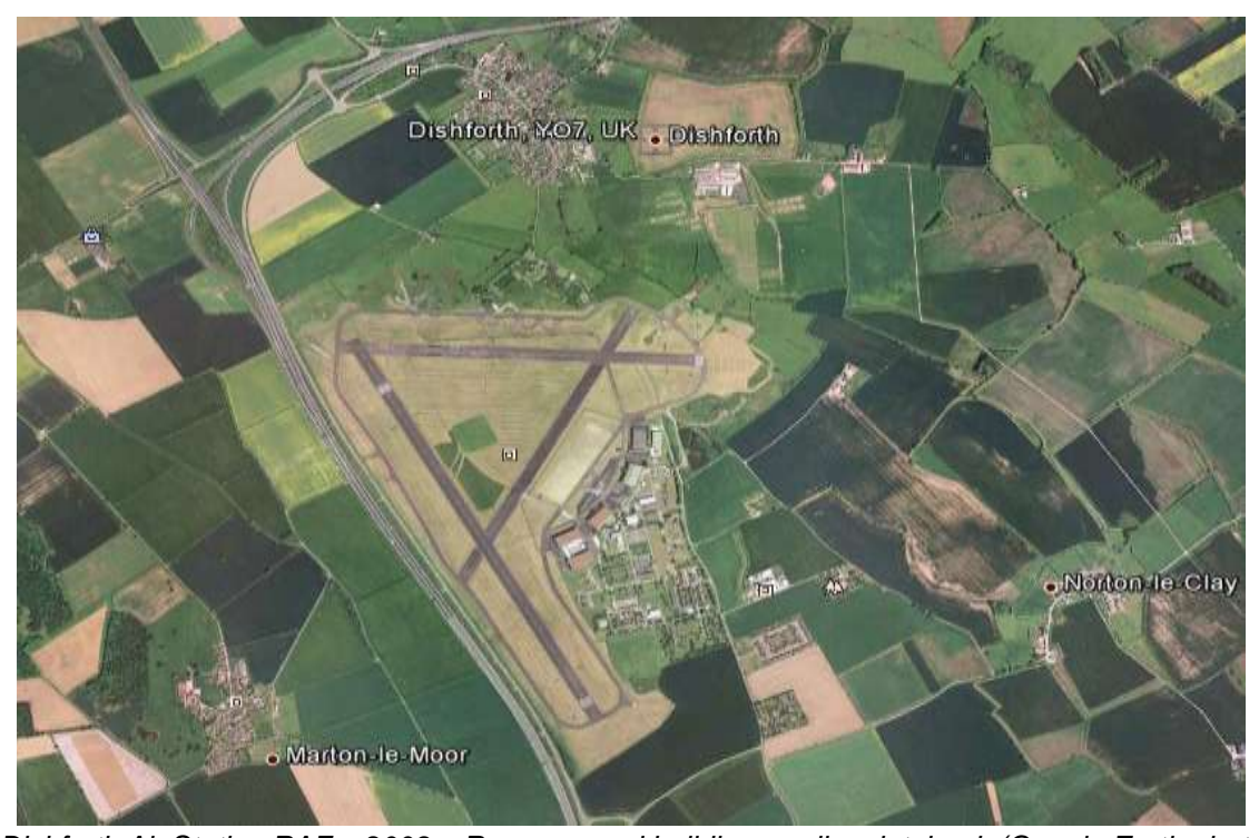
Dishforth Air Station RAF – 2009 – Runways and buildings well maintained.

(No. 425 'Allouette' Squadron transferred to No. 331 (RCAF) Wing – Tunisia, Mediterranean Air Command: 16 May 1943 to 5 November 1943 – and then returned to Dishforth on Operations with Halifax B.Mk.III aircraft in November 1943).