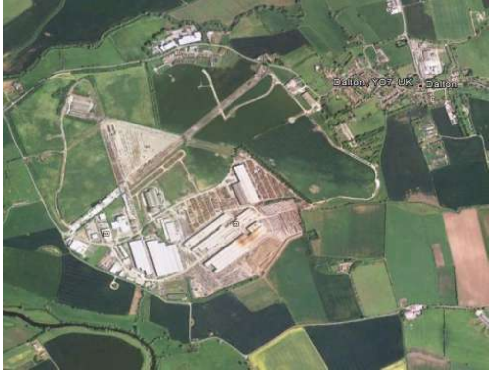
Dalton Airfield in 2009 – the runways (no longer in use), and the perimeter track are still clearly visible. Most buildings are additions from the past fifty plus years of commercial activity.

In December 1943, Dalton Air Station was transferred to No. 7 (Training Group) RAF, and no further RCAF units made use of the airfield during the remainder of the War.