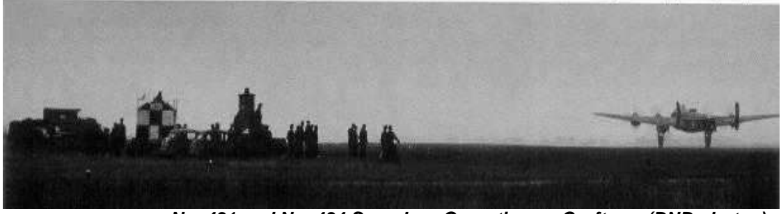
No. 431 and No. 434 Squadron Operations – Croft.