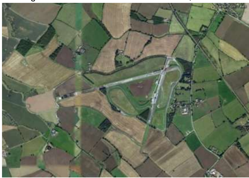
Air view of Croft Airfield - ca. 2009 -