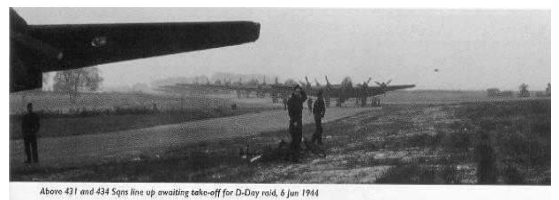
Below 431 and 434 Sqns groundcrew gather to watch their aircraft take-off from Croft